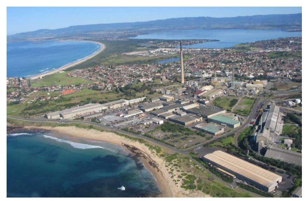
MM Kembla's Australian manufacturing facilities at Port Kembla.

MM Kembla manufacturing processes and quality systems are built upon 100 years of experience in manufacturing copper tube. An intensive ISO9001 certified quality control system is applied to all MM Kembla products. MM Kembla also has a variety of third party accreditations to Australian, New Zealand, British/ European and American standards.