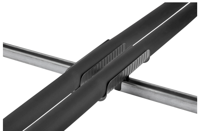
Perfect for insulated tube