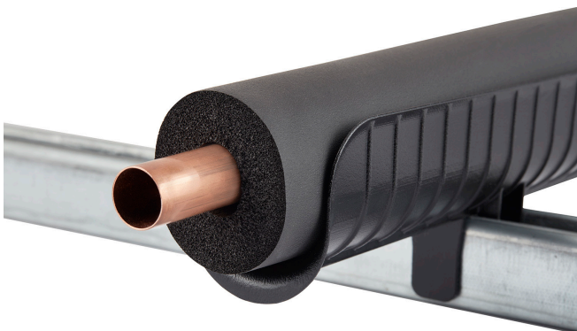
Easy snap on design for channels